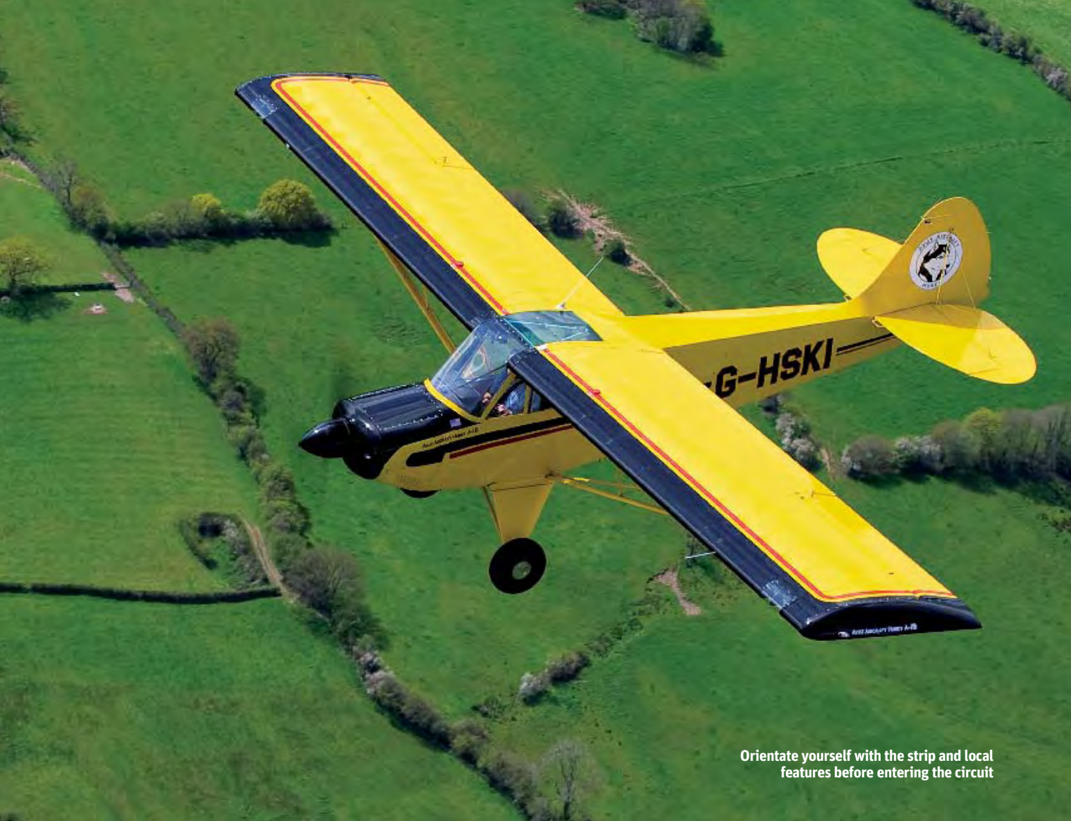
Orientate yourself with the strip and local features before entering the circuit

crab approach to compensate – your choice. Ensure that the crosswind is within the limits of both the aircraft and your ability. This may sound a strange one to add in, but how many accident reports have we read where the aircraft ground-looped on landing?